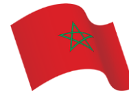
Karim El Aynaoui